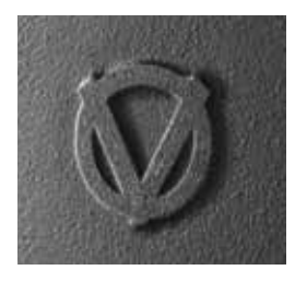
Door, top plate, grate and flue made of high-quality cast iron