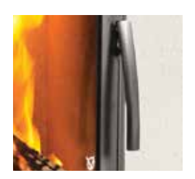
Ergonomically designed handle