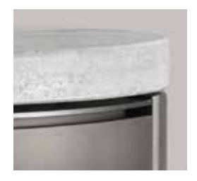
Accessory: Soapstone top