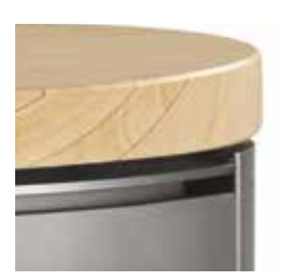
Accessory: Sandstone top