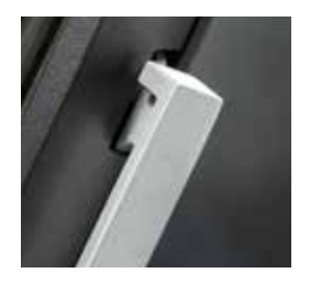
Ergonomically designed, contrasting handle

Displaying a superb view of soaring flames, the stove features an expansive ceramic glass window which is kept clear by the powerful Airwash system.